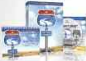
Crown Money Map™ Financial Software