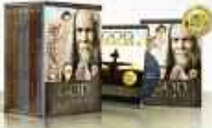
God Provides™ Film Learning Experience