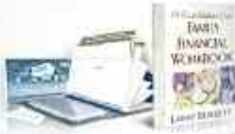
Family Budgeting Package