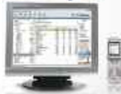
Crown™ Mvelopes® Online Budgeting System