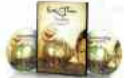
Family Times Virtue Pack