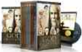
God Provides™ Film Learning Experience

It is more important than ever to make wise financial choices, and God's Word offers answers for all life stages and all circumstances. Let us help you encourage your family and friends. When you purchase resources from Crown, you help fund our ability to teach God's financial principles to more people around the world.