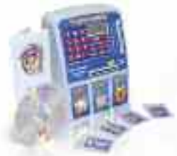
The Learning ATM