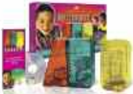
ABC Learning Bank